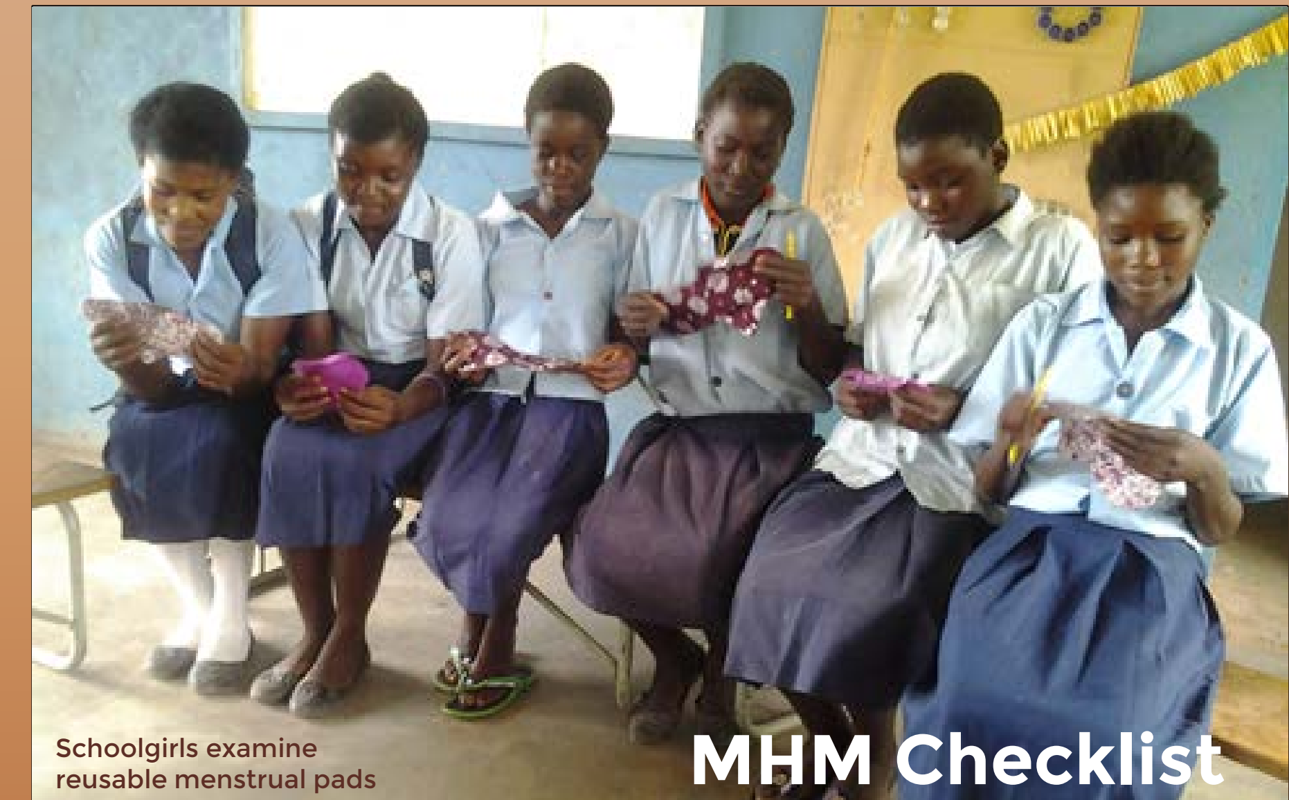
Schoolgirls examine reusable menstrual pads